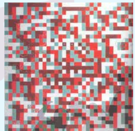
Salvador Dali’s “Cybernetic Odalisque - Homage to Béla Julesz” (1978) (Best seen with red-green glasses)